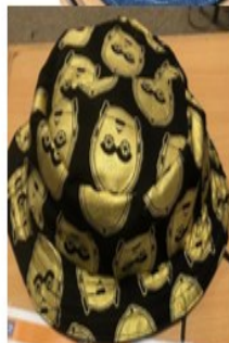
Y9 Textiles made reversible, upcycled bucket hats.