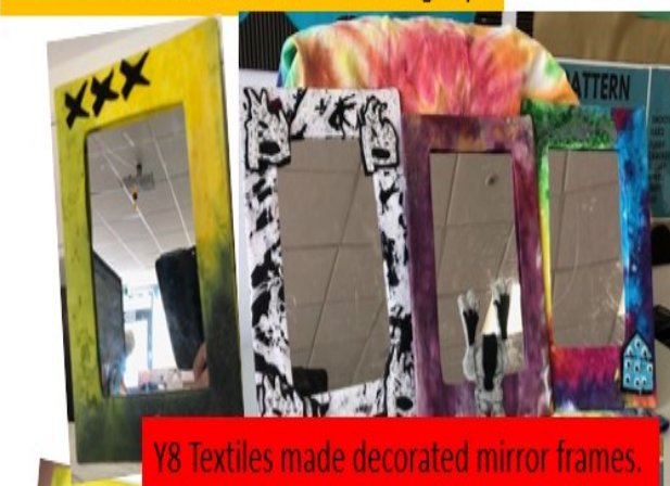
Y8 Textiles made decorated mirror frames.