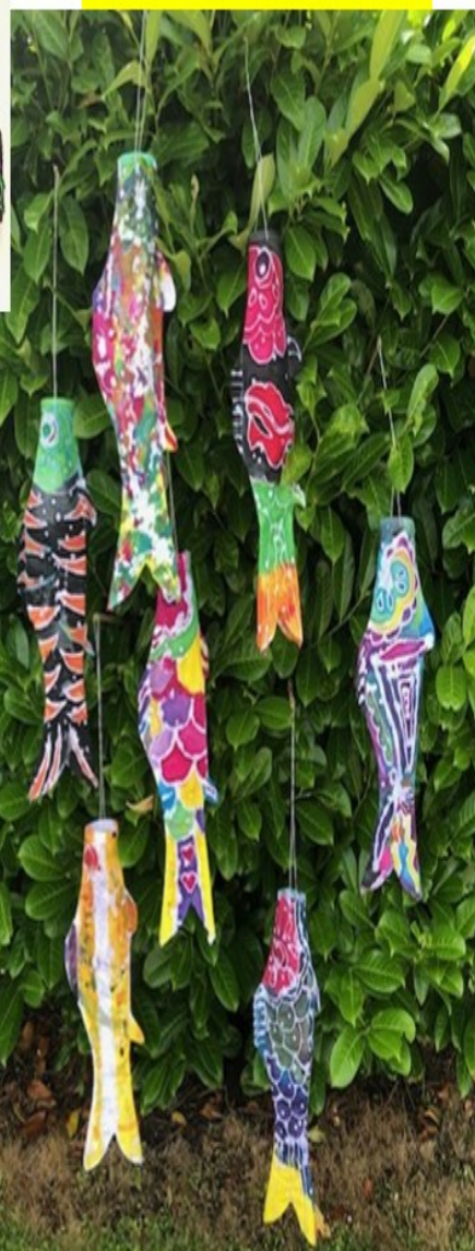
Y7 Textiles made Japanese Koinobori Streamers