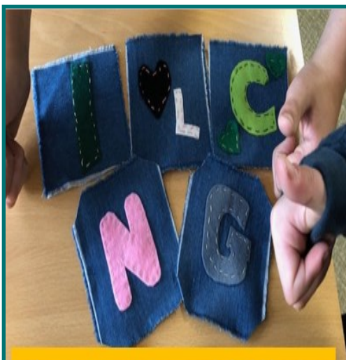
Y6's made some coasters on their visiting days.