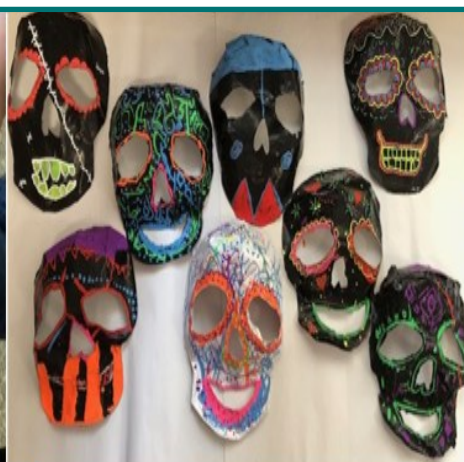
Y7 Art – made Day of the Dead masks